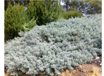
Blue Horizon™ Eremophila glabra prostrate 'EREM1' PBR